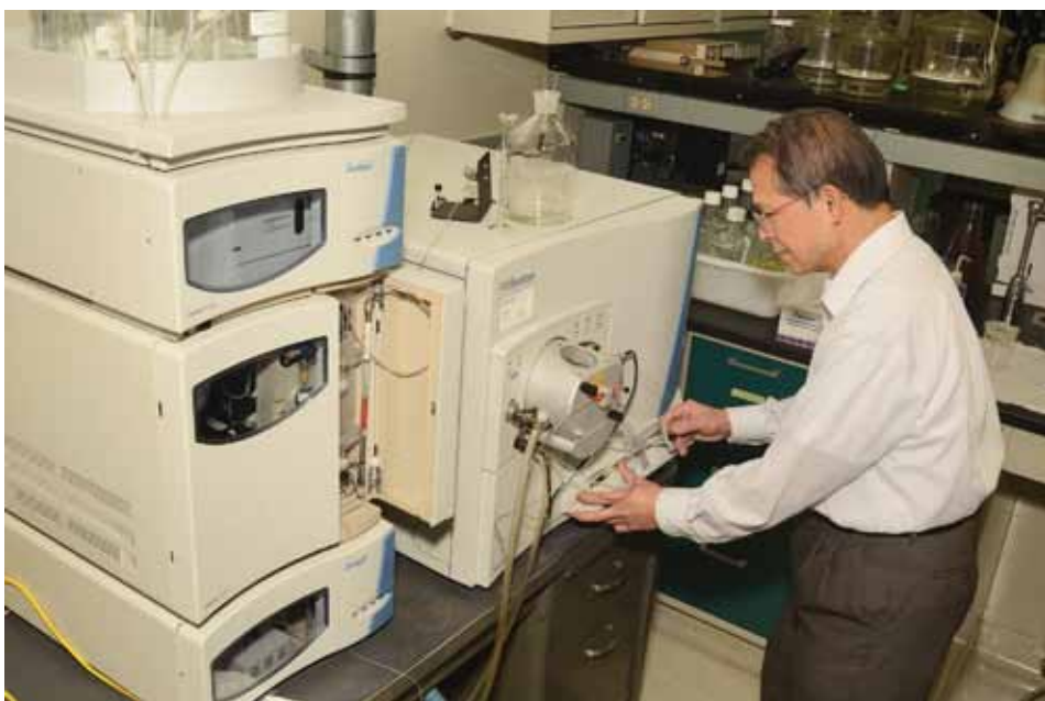
DE WOOD (D2862-1)

A protocol developed by chemist Ken Lin helps to simplify the use of ESI-MS (electrospray ionization mass spectrometry) to determine whether an olive oil sample contains oil other than that extracted from olives.