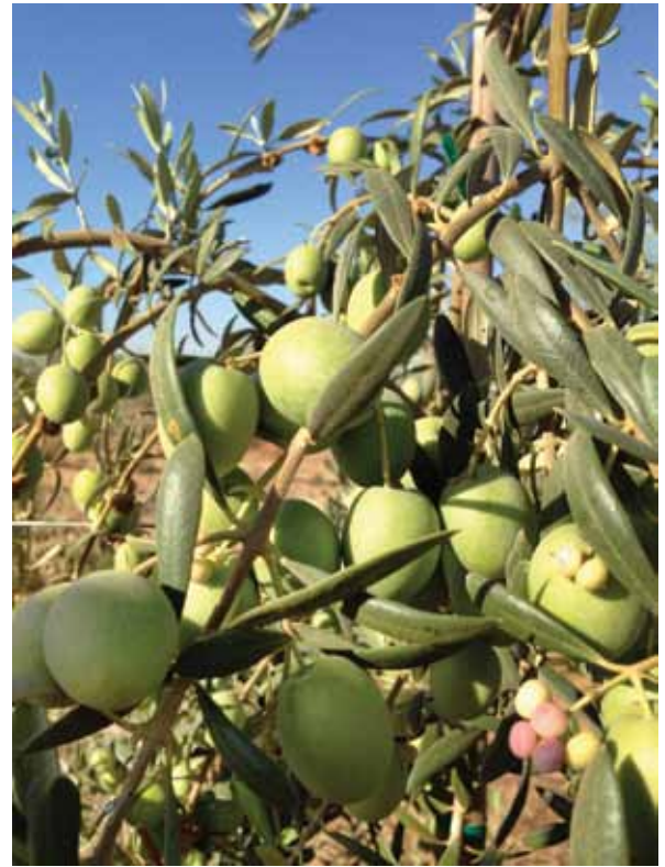
Fully mature olives growing in a California orchard. The state's 2012 olive harvest of 320 million pounds was worth about $130 million.

The ability of olive extracts to kill foodborne pathogens has been reported in earlier studies conducted at Albany, Tucson, and elsewhere. However, the E. coli and amines study, reported in a 2012 issue of the Journal of Agricultural and Food Chemistry , may be the first to show olive powder's performance in concurrently suppressing three targets