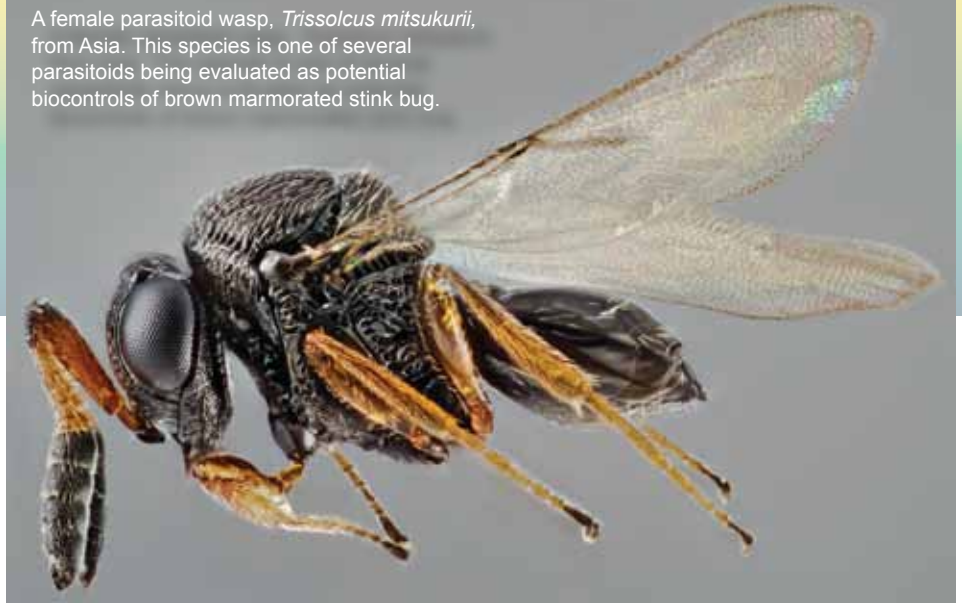
A female parasitoid wasp, Trissolcus mitsukurii , from Asia. This species is one of several parasitoids being evaluated as potential biocontrols of brown marmorated stink bug.

"Sequencing the genome will tell us about the genes that give this insect its defense mechanisms and its ability to respond to threats, such as pathogens that we might want to use against it. It might give us clues, for instance, how it may develop resistance to insecticides," she says.