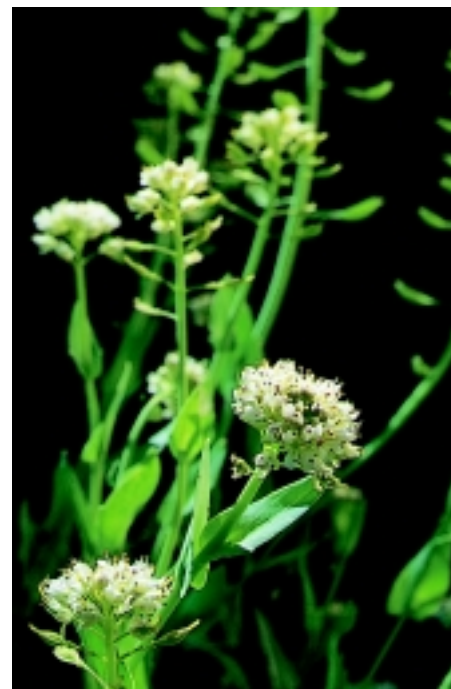
Alpine pennycress doesn’t just thrive on soils contaminated with zinc and cadmium—it cleans them up by removing the excess metals.