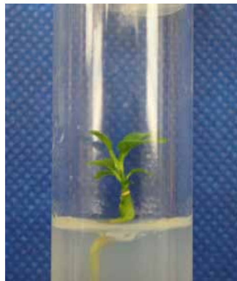
RICHARD LEE MARCH (D2881-1)

Citrus shoot tips were cryopreserved and then micrografted onto seedling rootstocks. This recovered plant is about 2 months old.