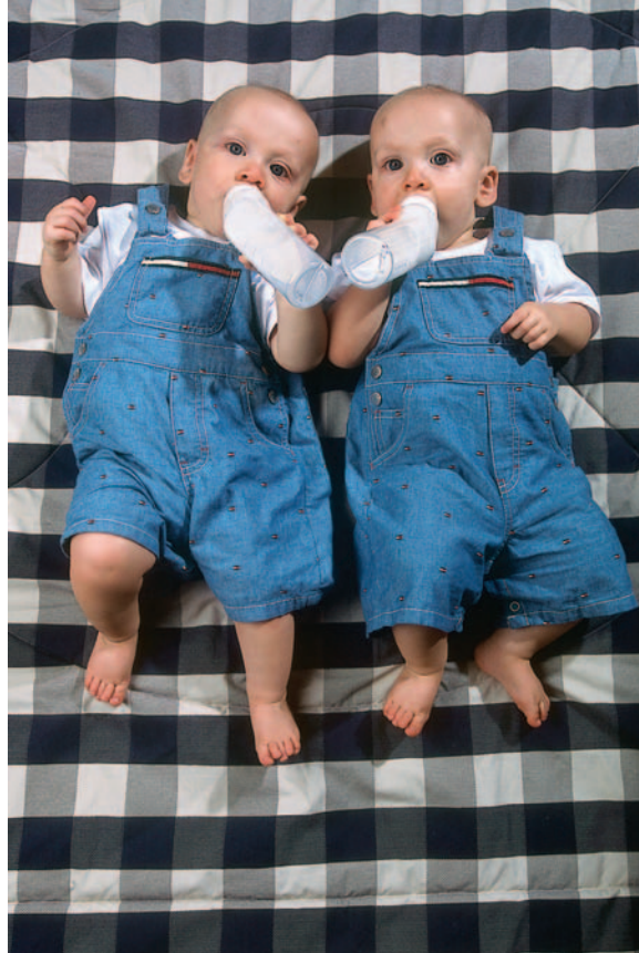
Known as the “soy twins” in the study comparing health effects of soy-based formula, cow’s milk-based formula, and human breast milk, these 8-month-old boys take time out from a busy study schedule to enjoy a bottle of formula.