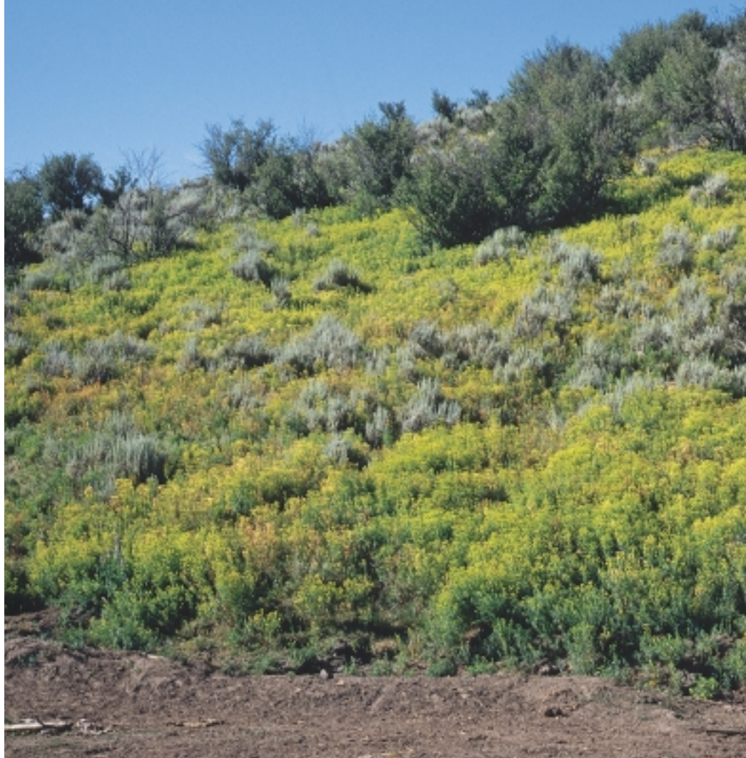
Leafy spurge overtaking a natural hillside in Colorado.