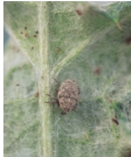
The Scotch thistle weevil from Spain is being evaluated in the Albany quarantine facility to determine if it is safe for release in the United States.