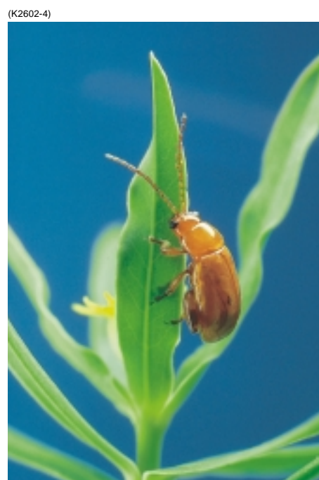
(K2602-4) Aphthona flava flea beetle feeding on leafy spurge.

Biological control aims to restore some of a weed's natural complement of enemies, making it less damaging here. This approach has been used successfully and safely for many years. Since 1945, more than 110 insect species have been released in the continental United States