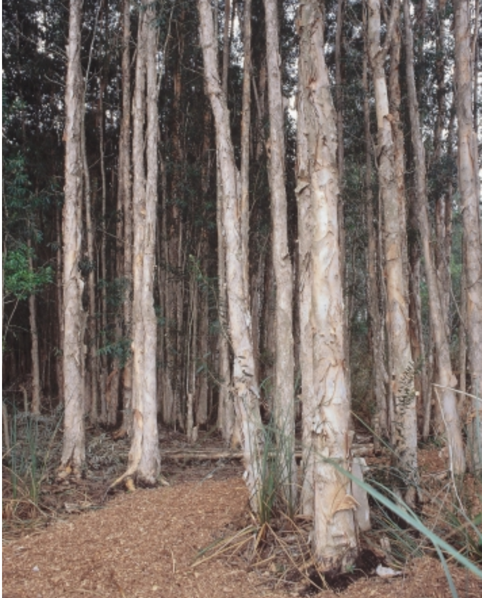
Near Fort Lauderdale, Florida, 50-foot-high melaleuca trees threaten to destroy the delicate ecosystem of the Everglades.

Both melaleuca and O. vitiosa , the melaleuca leaf weevil, are native to Australia, but neither is a pest there. ARS scientists turned the 1/4-inch-long weevil loose at 13 melaleuca-infested sites in Florida in 1997, after exhaustive greenhouse testing and investigations by colleagues in Australia showed the insect would not attack other plants. (See “Aussie Weevil Opens Attack on Rampant Melaleuca,” Agricultural Research , December 1997, pp. 4-7.)