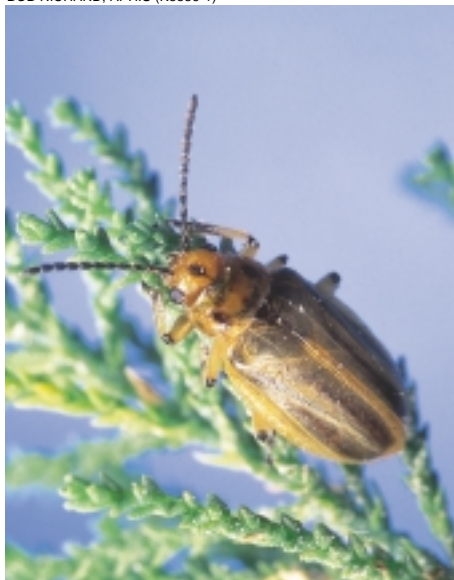
The leaf beetle Diorhabda elongata is the first approved biological control agent for saltcedar in the United States.