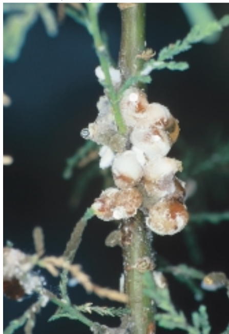
Mealybugs ( Trabutina mannipara ) are being considered as a biological control agent for saltcedar. These egg sacs are on saltcedar in quarantine at Temple, Texas.