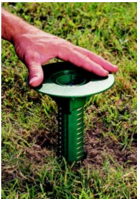
A termite monitoring/baiting station is being installed in a grassy area. The station is manufactured by Dow Agrosciences.