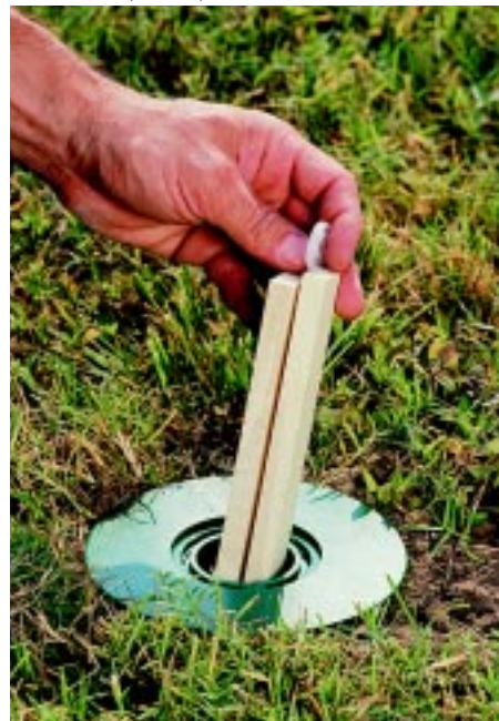
Wood blocks placed in this monitoring/baiting station are checked at regular intervals for signs of termite activity. If any is found, poisoned baits are placed inside. Foraging workers consume and spread the poison throughout their colony.

maps will help scientists identify termite hotspots where baits or other controls would be most effective.