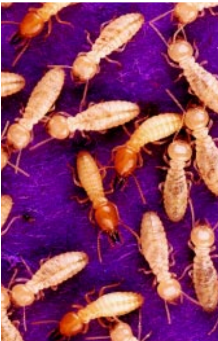
Formosan subterranean termites are feeding on Sudan-red-stained filter paper. Tracking the termites stained with this dye allows researchers to estimate their foraging range and population numbers.