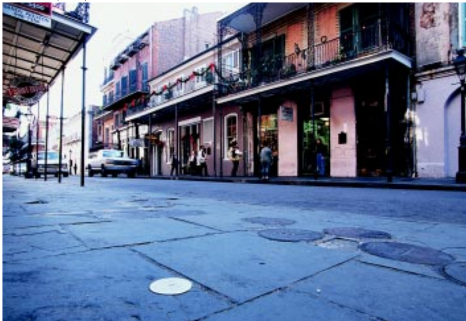
The French Quarter in New Orleans harbors one of the heaviest Formosan subterranean termite infestations in the country. Here, a tamper-proof metal cap in the street marks the location of a monitoring/baiting station in an area that is already under treatment.