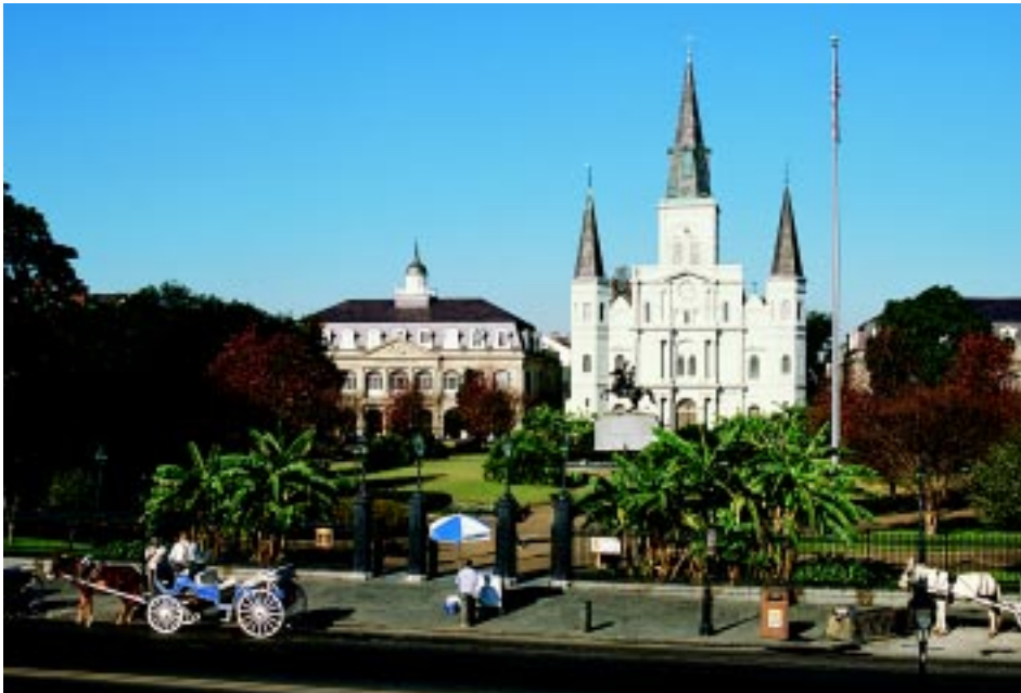
Formosan subterranean termites show no respect for historic Jackson Square (foreground), St. Louis Cathedral, or the neighboring Cabildo at left, where the Louisiana Purchase transfer ceremony took place in 1803.